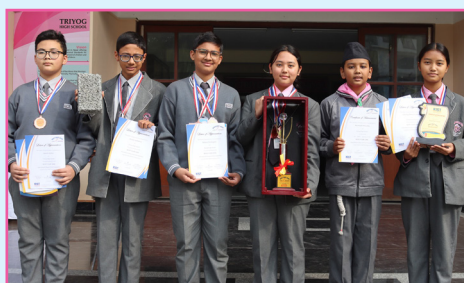
Third Position KIST Fair - Inter-School/College SciTech Competition