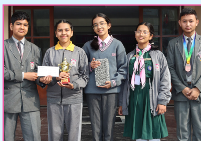
First Position KMC Science Exhibition