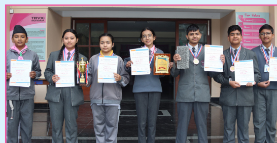
Third Position 12 th Southwestern Science Exhibition