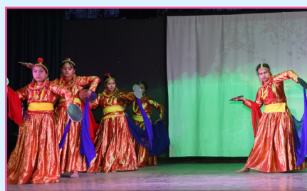
Grade VI students honored the musical genius Ambar Gurung during their class day performance. They showcased renditions of songs composed, written and sung by Ambar Gurung as a tribute to his legacy. Students also showcased the phases of Gurung's struggle and success through English and Nepali skits.