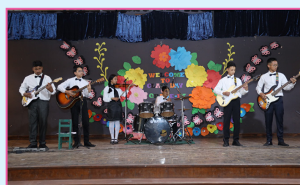
Grade IX learners celebrated their Class Day with vibrant and consonance performances. Each new act brought excitement and curiosity to the audience, with the synchronized performances of dances, songs, plays, and poems making a powerful impact. This event served as an inclusive platform where learners of varied talents came together to put up an exceptional show.